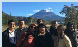
In front of Mt. Fuji