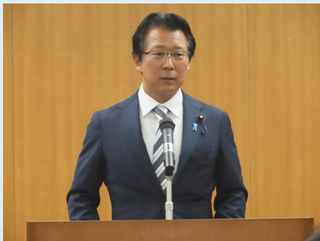
Photo: Parliamentary Vice-Minister Kanda delivering a speech

On September 19, State Minister Ibayashi and Parliamentary Vice-Minister Kanda came to the FSA for the first time, delivered speeches to the FSA staff and succeeded to the duties of their respective predecessors, former State Minister FUJIMARU Satoshi and former Parliamentary Vice-Minister SUZUKI Eikei.