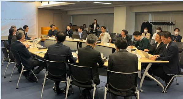
Photo: Discussions at Roundtables

The Chatham House Rule* was adopted to encourage constructive discussions among stakeholders at the roundtables held on various topics, and frank and free discussions were made at the roundtables.