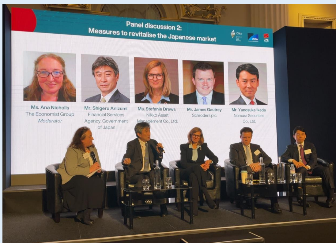
Photo: Panel Discussion