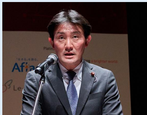
Photo: Closing address at the first day by State Minister of Cabinet Office Ibayashi