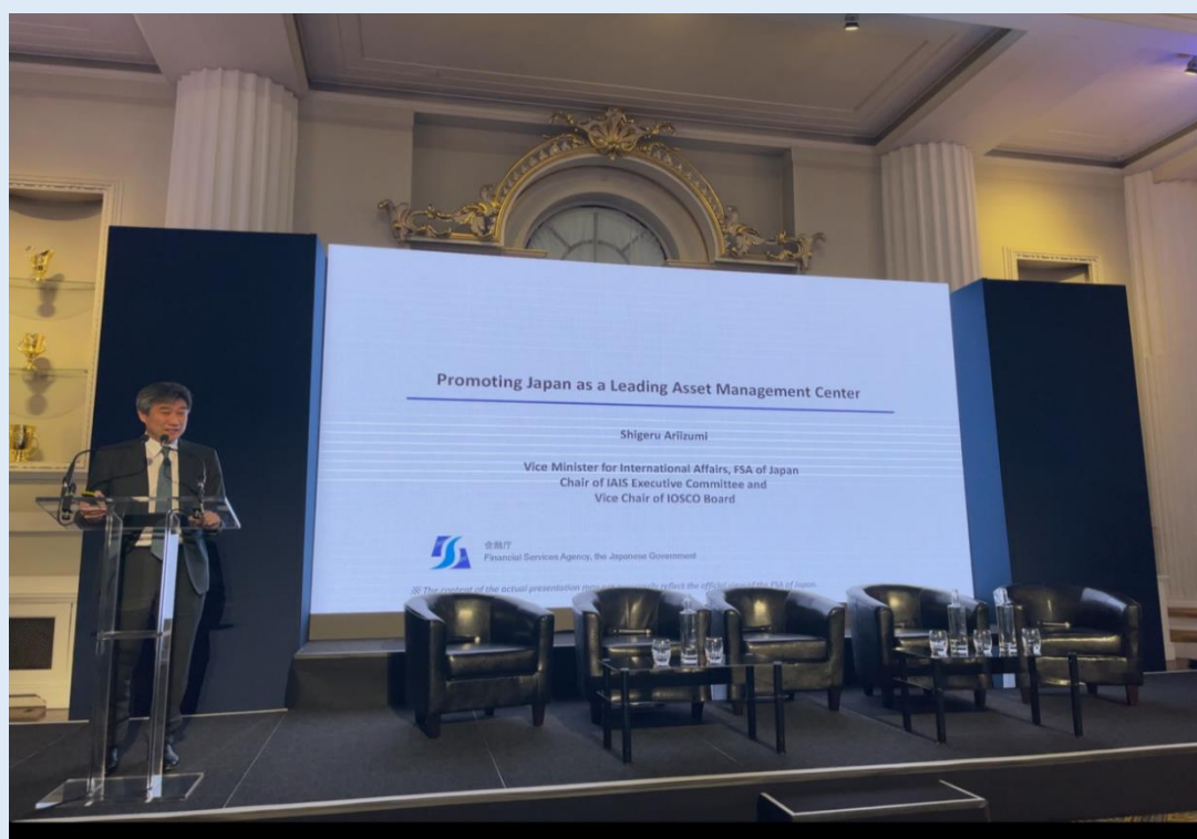
PHOTO: Vice Minister for International Affairs Ariizumi's Lead Speech

https://www.fsa.go.jp/common/conference/danwa/20240306.pdf