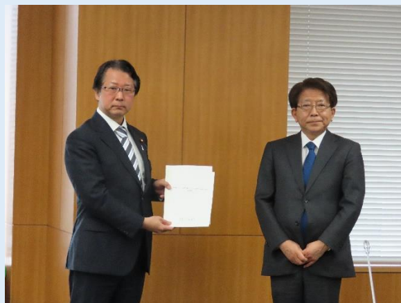
Photo: Horie, Chairperson of the Audit Standard Committee, handed the written opinion to Parliamentary Vice-Minister Kanda.