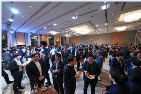
Photo: Reception co-hosted by FSA and Fintech Association of Japan

During the Japan Fintech Week 2024, various networking events were also held in addition to the above related events.