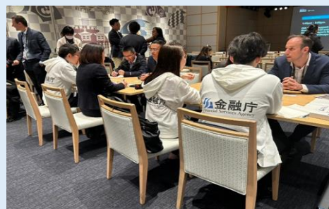
Photo: On-site Consulting Services by Dispatched Consultants

During the Japan Fintech Week 2024, consultation booths were set up at the FIN/SUM venue (Marunouchi Building) and a part of the Japan Fintech Festival venue (Kanda Myojin) for on-site consultations. We not only provided consulting on matters related to regulations but also exchanged general opinions on business. We received inquiries and questions about cross-border remittance business from overseas operators, and we provided them with information on types of licenses, registration requirements, flow to registration, and processing time for registration, etc.